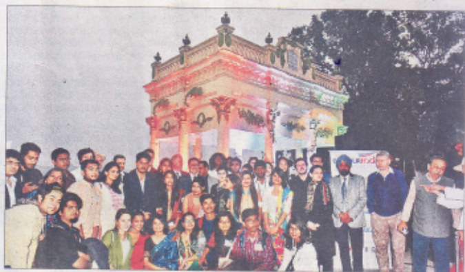
Participating students of the heritage workshop with the ambassador in front of an illuminated Joraghat