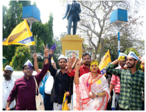
Aam Aadmi Party celebration in Kolkata. BISWAJIT GHOSHAL

In significant decisions, the ECI on Monday recognised Aam Aadmi Party (AAP) as a national party and withdrew this recognition given to the Nationalist Congress Party, CPI and Trinamul Congress. In other decisions, the poll panel gave recognition to Lok Janshakti Party (Ram Vilas) as a state party in Nagaland and Tipra Motha Party was recognised as a state party in Tripura. Bharat Rashtra Samithi has been derecognised as a state party in Andhra Pradesh. The poll panel also withdrew the state party status of