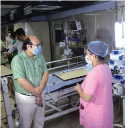
Covid mock drill at MR Bangur Hospital in Kolkata on Tuesday.