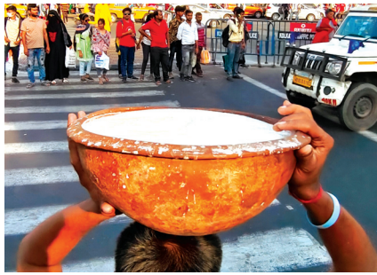
(L-R) As the city feels the heat, curd is much in demand to fend off the temperature, while a dog enjoys a ride on a hot summer day. BISWAJIT GHOSHAL

In view of hot and discomforting weather which is likely to prevail from 10-15 April, the West Bengal government has issued an advisory requesting people to avoid heat exposure and wear lightweight, light-coloured loose cotton clothes. It has further requested the people to cover their heads, use umbrellas or hats. Drink sufficient water even if you are not thirsty to avoid dehydration. Those who work outdoors have been requested to avoid direct sunlight from 11 a.m. to 4 p.m. Schedule strenuous jobs at cooler times of the day. Those who work outdoors have been advised to increase the frequency and length of rest breaks. People have been advised to consult doctors if there